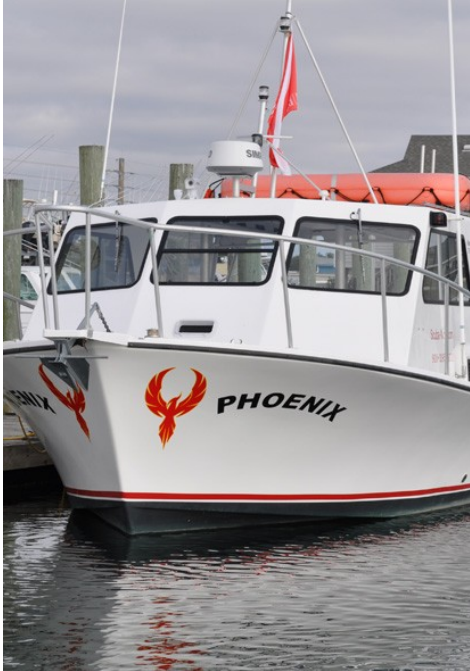
2011 Newton-36-ds 41' Long 14.5' Wide Dive Boat

1) The only official PADI and NAUI certifying agency in the area.